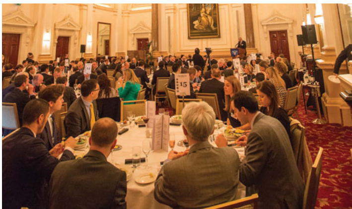
A captive audience in the Westin Dublin Grand Ballroom