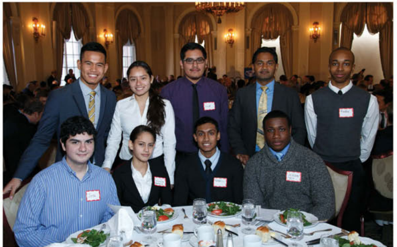
Aviation High School Students; table sponsored by JetBlue Airways