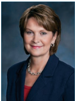
November 14, 2013 Marillyn A. Hewson CEO and President Lockheed Martin

“How to Inspire Innovation” was the topic chosen by Marillyn Hewson, for her presentation of the Wings Club 2013 ‘Sight’ Lecture. Hewson opened her remarks with the observation that the progression from the past, through the present and into the future, the hind-sight, insight and fore-sight of the ‘Sight’ Lecture, meant one thing to her: innovation. In particular, how we inspire innovation. “If I were to spell out our modern-day rules and practices for inspiring innovation, I’d say as leaders we must: (1) Create a climate where people can do their best work; (2) Embrace the best ideas regardless of where they come from; (3) Embark on missions that matter with a vision that inspires; and (4) Exemplify strong values in all that we do.”