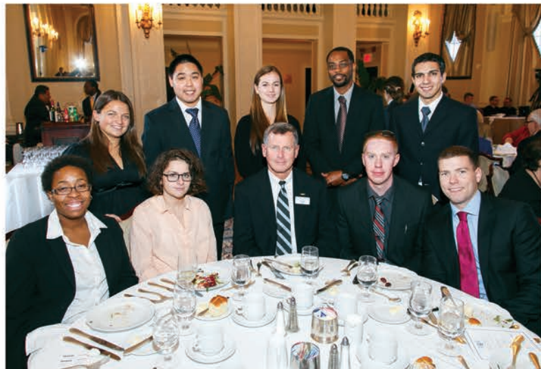
Farmingdale State College Students and Faculty