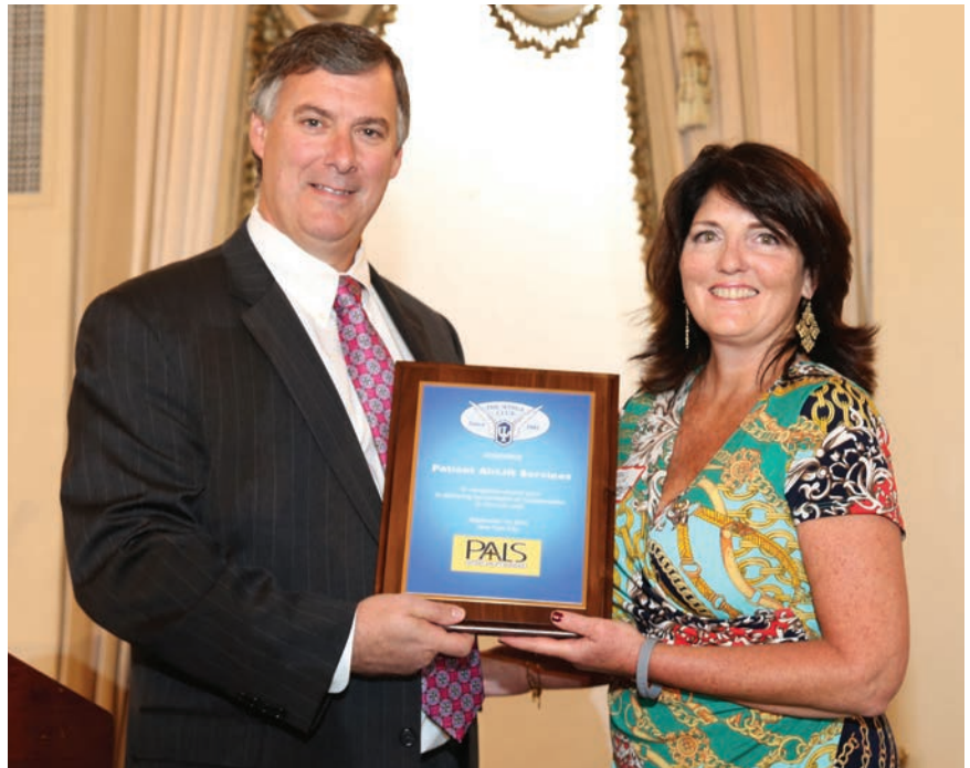
Patient Airlift Services (PALS)

Patient Airlift Services arranges free air transportation for individuals requiring medical diagnosis, treatment or follow-up who cannot afford or are unable to fly commercially. PALS